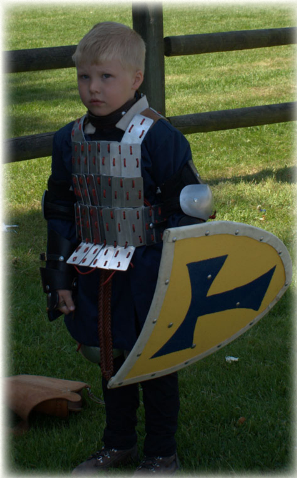
A young lord at May Coronet