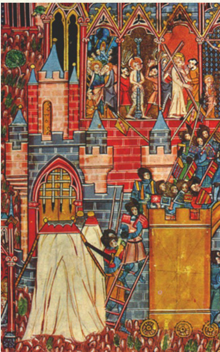
The siege of Jerusalem 1099