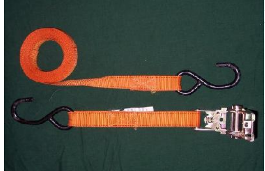
Illustration 1: The Ratcheting Tie Down as purchased

A couple of years ago I was looking through the Lee Valley catalogue (yes, every woodworkers dream store) and was introduced to the idea and use of the ratcheted strap clamp. Essentially a variation on the ratcheted tie down that we have all seen in use, or even used ourselves which has been modified to attach onto itself. In my opinion it is now one of the most invaluable tools in my collection, helping to save on much project time and frustration. A totally essential tool when clamping odd shaped or sized projects such as buckets and pails.