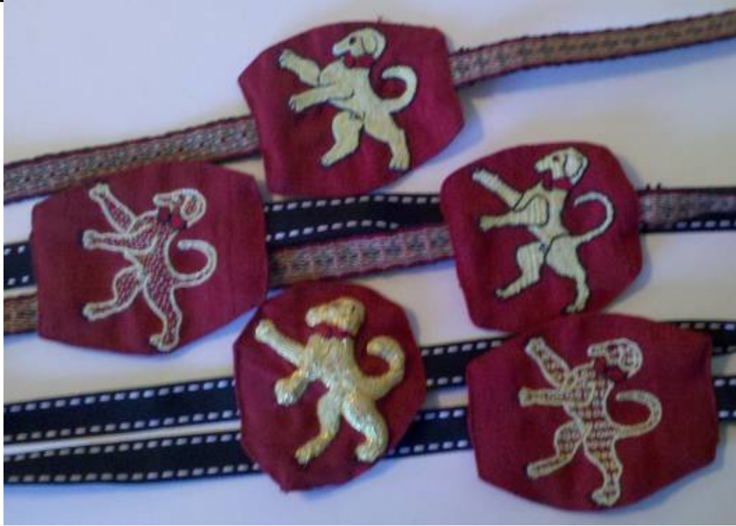
Baroness' Favours, presented at Baronial Banquet