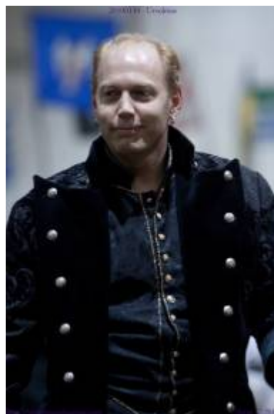
Provost Warwick Drakkar