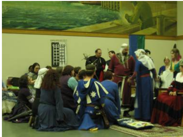
The entire Clan MacAndrew receives the Lions Claw