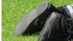
The candidates for Rapier Defender are sworn in.