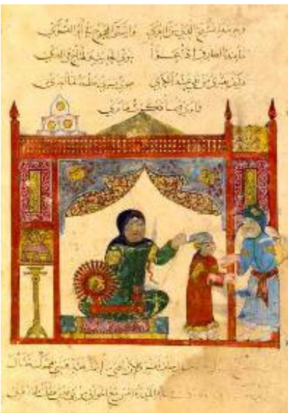
Exhibit E: Earliest known spinning wheel, Baghdad, 1237, http://lhresources.wordpress.com/workroom-textile-skills/history-and-gallery-spinning-2/ .