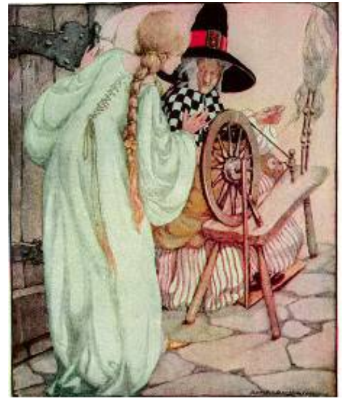
Exhibit D: The true culprit in Sleeping Beauty : the drop-spindle did it! Alexander Zick, Dornröschen , 1875.