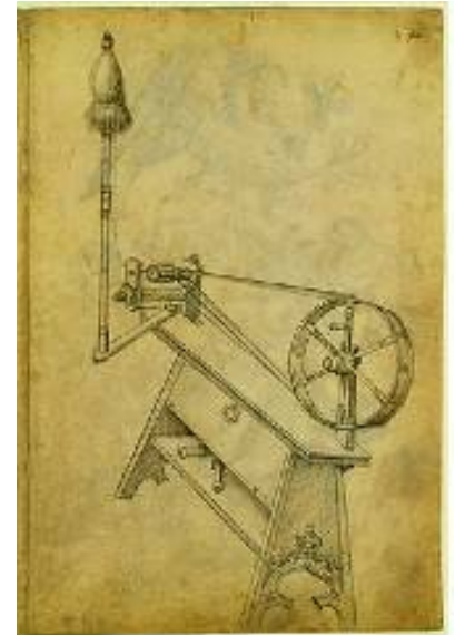
Exhibit A: Anonymous, Mittelalterliches Hausbuch / Medieval House Book , ca 1480. Another spinning mechanism with bobbin & flyer appears in Leonardo da Vinci Notes , about 1490. The treadle was added in 1533 by Juergen of Watenbuettel in Brunswick to give the more-or-less modern "Saxon Wheel": PJ Rehtmeyer, Chronicle of Brunswick-Luneburg , 1722, p 879.

The allegation of narcoleptic hazard supposedly comes from the following story (Charles Perrault "La Belle Au Bois Dormant / The Beauty of the Wood Sleeping" in Contes de Ma Mère l'Oie / Tales of My Mother the Goose , 1697, tale 1; Jakob & Wilhelm Grimm "Dornröschen / Briar Rose", in Marchen / Fairy Tales , 1812, vol 1, märchen 50). Fairies gathered at a princess' christening bestow gifts (surely from Germanic myth – Snorri Sturluson Prose Edda , 1220, part 1, sec 15 – of spinning goddesses who assemble to order the life of a human at birth: called Norns, equivalent to the Greek Moirai and Roman Nona: the Fates), one being a curse that the girl will someday prick her finger while spinning and die, which another fairy tempers to enchanted sleep. Yet, these labour-saving devices, in their latest version complete with treadle and separate spindle (that twists the yarn) and flyer (that winds the yarn about the bobbin), and in regular use from the 15 th - 16 th into the early 20 th C (see Exhibits A & B below), have in fact no actual sharp bits on which a finger may be pricked!