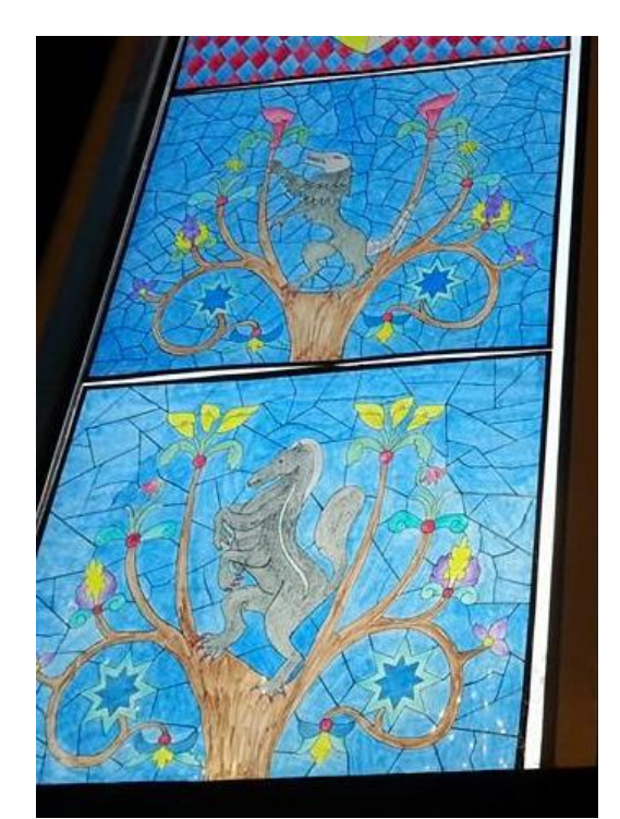
Loat and Lionsgator at 12th Night