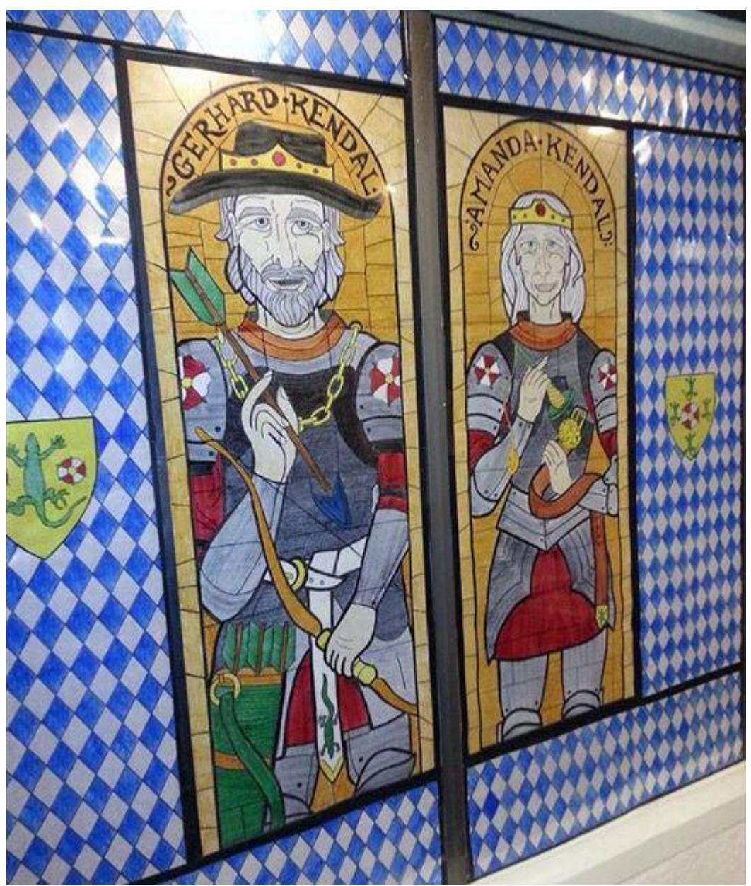
Gerhard and Amanda window decoration at 12th Night