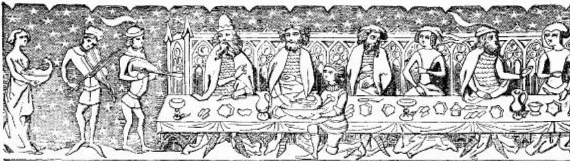
Figure 1. Accessed at http://www.gutenberg.org/files/12254/12254-h/images/illus046.jpg