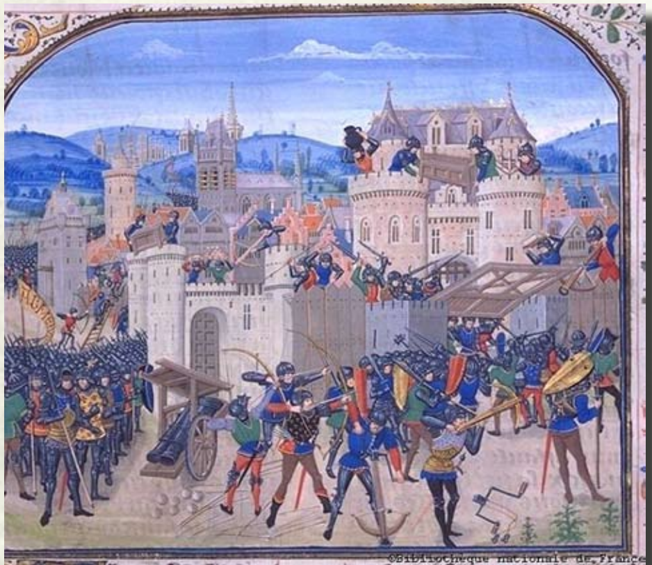
John of Hainaut besieging Aubenton (1340). Jean Froissart, Chronicles fol. 60 Flandres, Bruges 15th Century.

In 1339 Edward III of England declared war on France, beginning what would become known as the Hundred Years war. This war was the backdrop to some of the most famous medieval battles in history, Poitiers, Crecy, and of course Agincourt and it saw the long bow reach the pinnacle of its success as a weapon of war.