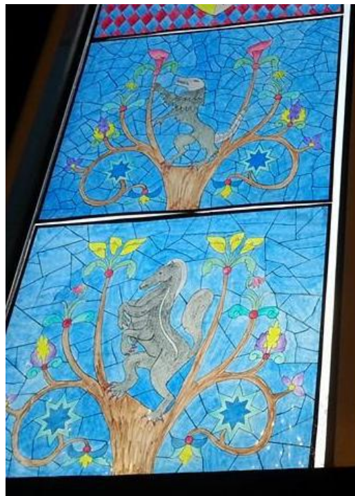
Loat and Lionsgator at 12th Night