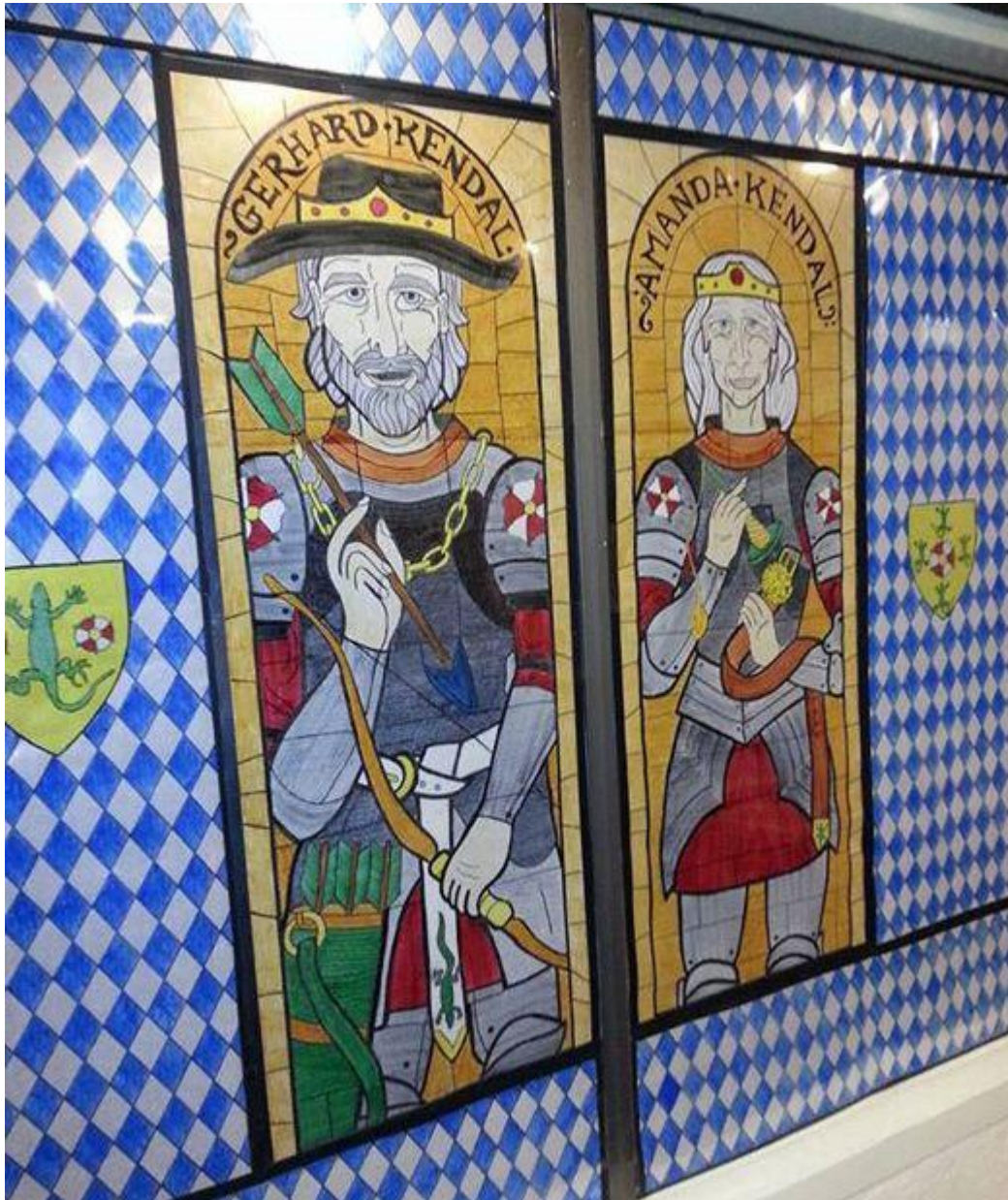
Gerhard and Amanda window decoration at 12th Night