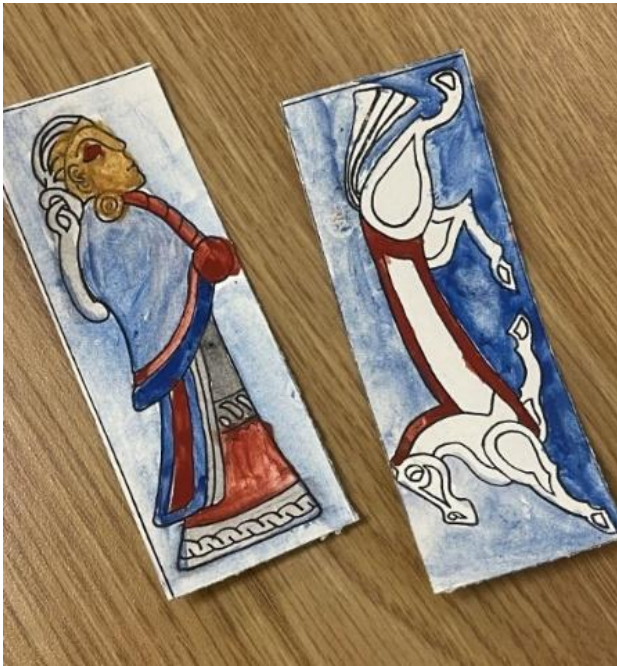
Scribal Paints at Langley Demo