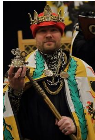
King Athos at 12 th Night